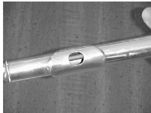
With the rod fully inserted into the headjoint, the line should be centered through the middle of the tone hole.