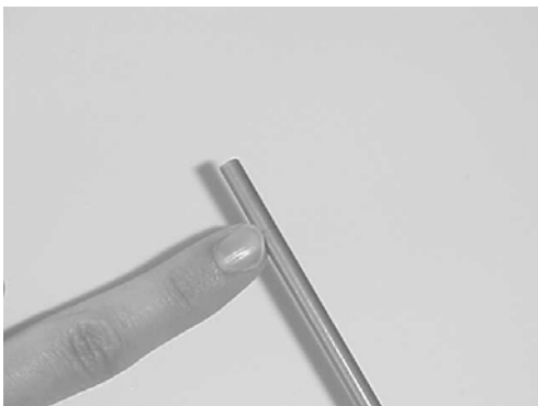
Locate the tuning line on the cleaning rod

Once each week you should also take a moment to check the tuning of your headjoint. The cleaning rod supplied with your instrument should have a line marked at the end opposite the hole. When this end of the rod is inserted all the way into the headjoint, the line should appear directly centered in the tone hole of the headjoint. If the line is off-center, let your director know so that appropriate adjustments can be made. Never try to adjust the tuning of your headjoint yourself. The illustrations below demonstrate this procedure.